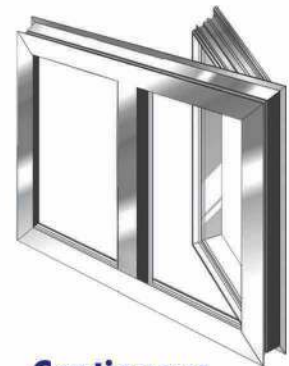
Continuous Master Frame Combo Units