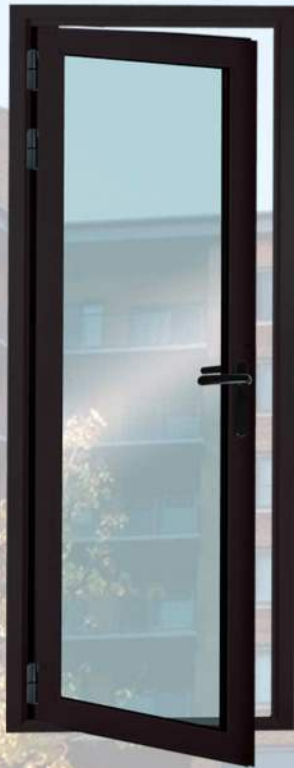
Outswing Standard AW-PG75