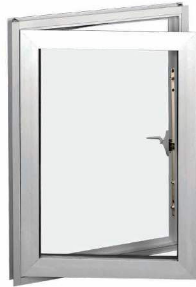
Series 8500 Aluminum Thermal-Break Casement Windows