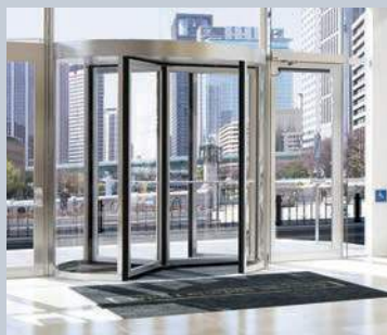
The ASSA ABLOY SW200i swing door operator complies with emergency egress requirements.